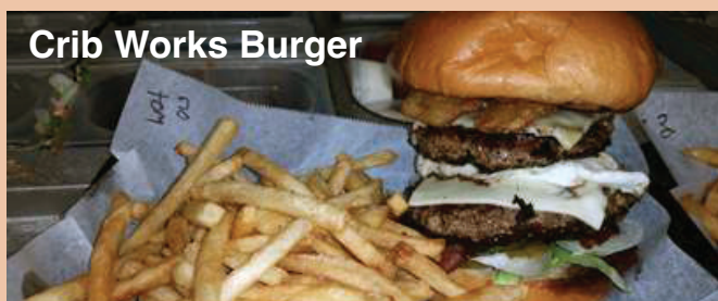
Crib Works Burger